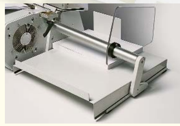
paper tray collects punched sheets

SEMI-AUTOMATIC PUNCHING The semi-automatic system developed by Renz, creates an entirely new class of machines. It is the first punching system to feature ease of operation, high output, and flexibility at an economical price.